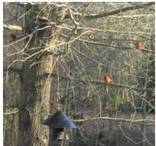
How many cardinals can you find? (red birds)